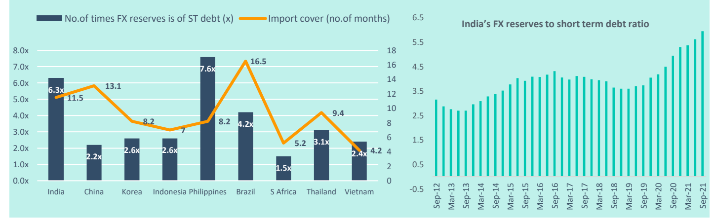
Chart source; Elara. Sources: Internal, Bloomberg, Elara, MOSL, GS. UBS, FPI - Foreign Portfolio Investor. FY - Financial Year, CY – Calendar Year; YoY is Year over Year, EM- Emerging Markets. EBITDA – Earnings before interest, tax, depreciation and amortization, PLI – Production Linked Incentive, 1HY22 – Half year 2022.

^THE DSP STRATEGY HAS BEEN IMPLEMENTED SINCE 14 NOV 2006, AUM ~US$ 1.8 BN, AS ON 31 MAR 2022 THROUGH CERTAIN PRODUCTS MANAGED BY DSP INVESTMENT MANAGERS PVT. LTD., WHICH ARE NOT AVAILABLE FOR INVESTMENT IN ANY JURISDICTION EXCEPT FOR INDIA.